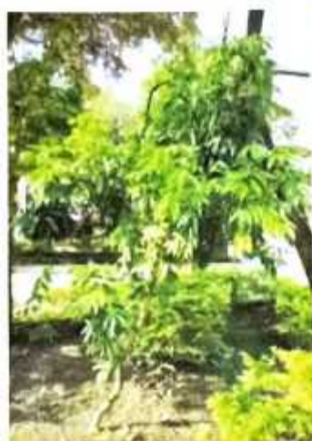
Litchi chinensis (lychee)